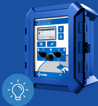
SOLO PROGRAMMABLE LIGHTING CONTROL