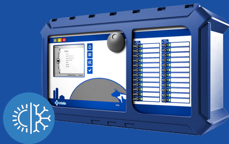
UNITY CLIMATE CONTROL